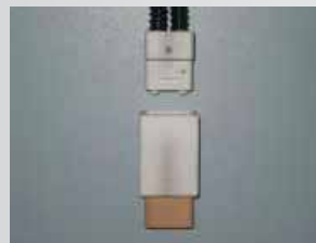
simple connector system for change of corona sections

Corona sections are available in 3 different sizes (up to 95mm width)