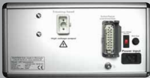
connections for SPS-control